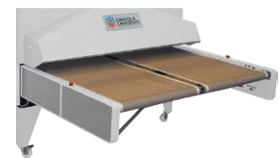
DOUBLE BELT CONVEYOR SIDE BY SIDE