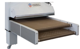
DOUBLE RETURNING BELT CONVEYOR