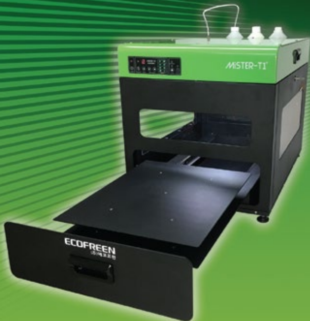
Mister-T1 (AUTOMATIC PRETREAT SPRAY MACHINE)